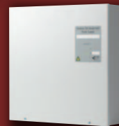
EN54 compliant power supplies