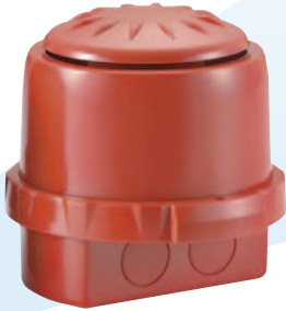
Sounder Part Number CP400SR

Our CP RANGE of wall-mounting Electronic Sounders and Sounder/Beacons provide good audibility in all directions. They have locally controllable output levels allowing the sound intensity to be adjusted to suit the application. If required, the use of a third wire enables a second stage alarm to be switched to override the selected tone. These versatile features allow them to work seamlessly with most fire detection systems. All fully comply with EN54 and have a protection rating of IP65. Also available is a motorised bell.