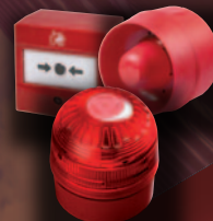
Addressable Signalling devices