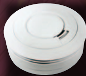
Stand-alone mains & battery operated smoke, heat & CO alarms