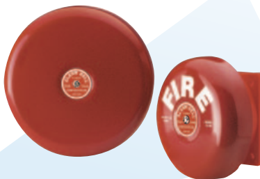
Motor Driven Dome Bell Part Number CP250BR