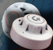
Addressable smoke and heat detectors