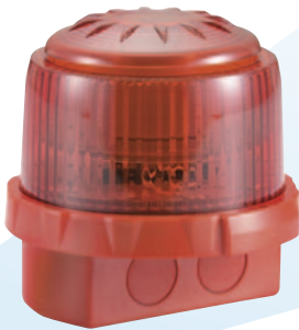
Sounder/Beacon Part Number CP450SER