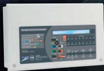
Addressable fire detection panels