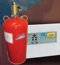
HFC227ea Conventional fire suppression systems