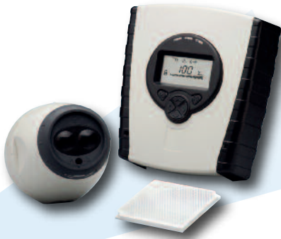
Intelligent Auto-Aligning Beam Detector Part Number SA7100-100