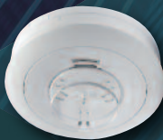
Conventional wireless fire alarm systems