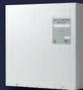
EN54 compliant power supplies