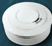
Stand-alone mains & battery operated smoke, heat & CO alarms