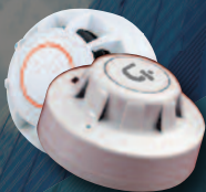
Conventional smoke and heat detectors