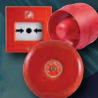
Conventional signalling devices