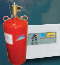
HFC227ea Conventional fire suppression systems