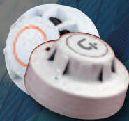
Conventional smoke and heat detectors