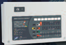
Conventional fire detection panels