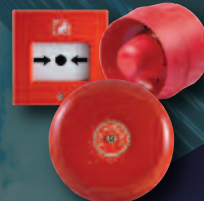
Conventional signalling devices